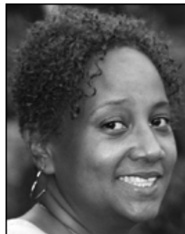
June Travis Fellowship

Please join us in congratulating this year's Fellowship recipients. These three outstanding women will each receive the opportunity to attend the 2011 WICT Leadership Conference.